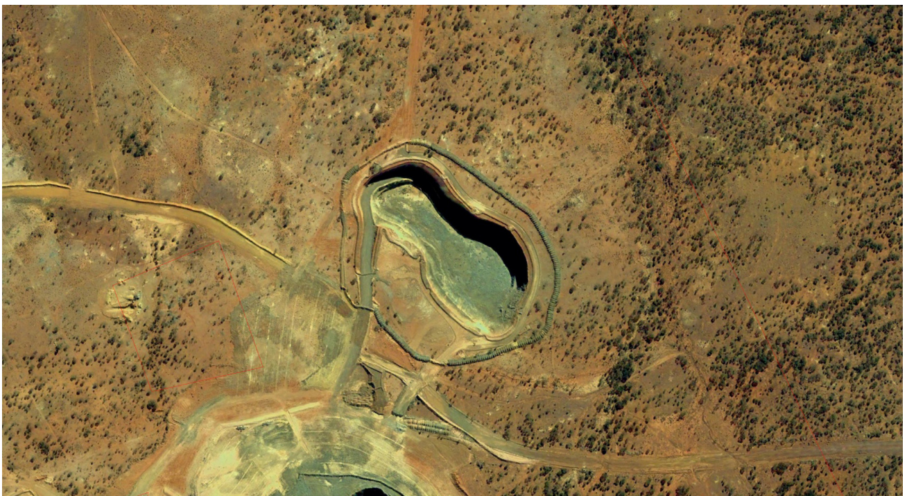
Photo 3. The Butterfly pit with readily accessible ore available for toll treating. The Butterfly pit lies 6.5 kilometres from the Goldfields Highway with mill facilities to the north and south of Nex's Kookynie Project. Blast holes from 2002 that were never used can still be seen in the pit floor.

Nex has engaged in discussions with several local mill facilities to toll treat a portion of its current gold resources. Previously optimized ore remains within the current outlines of the Admiral and Butterfly pits and represents readily accessible tonnes of 2.2+ g/t Au material (Photos 3 and 4). Nex plans to toll treat approximately 200,000 tonnes of ore from the Butterfly pit to generate swift cash flow.