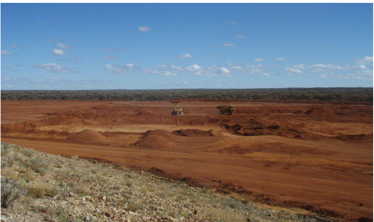
Photo 1. The Komatsu WA800-2 and one of the CAT 777Bs working in the stormwater pond with the pregnant and barren solution ponds in the foreground.

Work continues on the heap leach with extensive earthworks. The stormwater, and pregnant and barren solution ponds have been excavated and contoured in preparation for laying the plastic liners (Photos 1 and 2). The heavy haulage road for ore transportation has also been completed in conjunction with the flood bund along Dingo Creek.