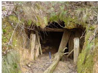
Day Dawn South East adit