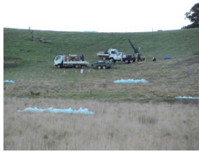
Spion Kop RC drilling

NSW Department of Trade & Investment, Regional Infrastructure and Services Resources & Energy has granted an exploration licence totalling 230km 2 covering prospective stratigraphy in the emerging Silurian Gold Province of New South Wales. Soil sampling is planned to be completed in the next quarter on the Billilingra and Billilingra South Prospects.