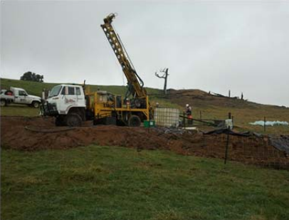
Spion Kop Diamond drilling