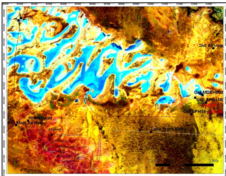
Figure 1. Location of drill holes (Land-Satellite Image)

Figures 1-3 display the location of the planned drill holes M12A and M12B on site at the Mt Barrett project.