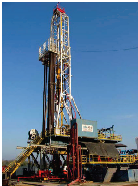
AD-1 drilling Rig

As demonstrated by the Operator elsewhere in Thailand, any discovery at L20/50 can be very quickly commercialised with crude oil transported by truck to one of Thailand’s nearby oil refineries for sale.