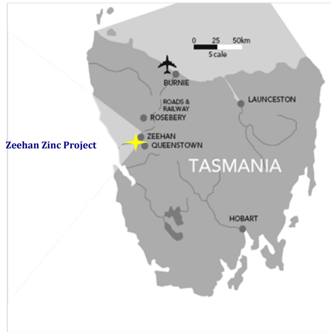
Figure 1 Location of Zeehan Zinc Project