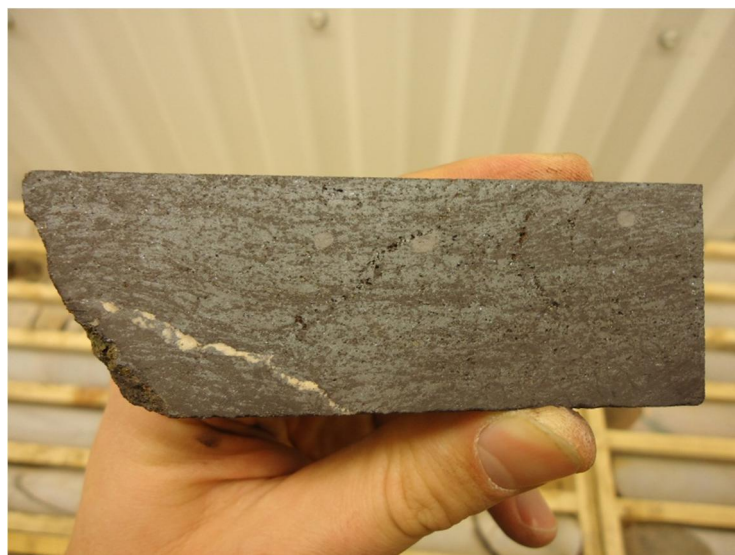
Magnetite-hematite ore from HAR11004