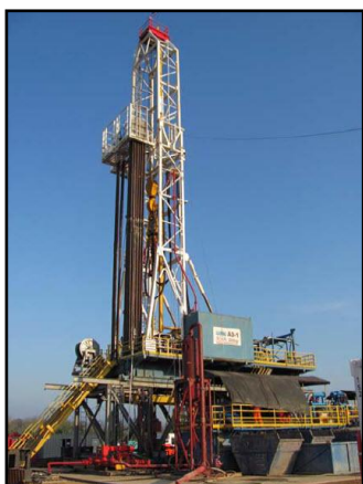
AD-1 Drilling Rig