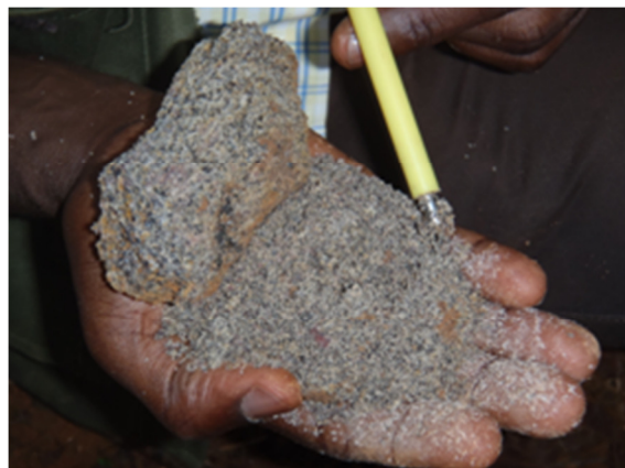
Left: Medium-coarse grained, laminated quartz-magnetite iron formation (sample MC1001). Right: weathered variety of similar rock type crushed by hand forming soft, friable quartz-magnetite sands easily beneficiated by magnet pen (sample MC1003).