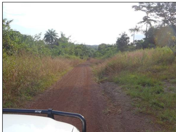
Left: Well-maintained sealed main road from Monrovia through license area. Right: Laterite road, topography and vegetation within license area.