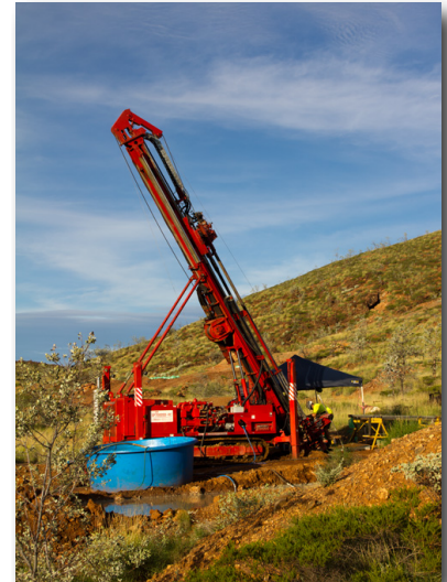
Fig 1. Drilling underway at McPhees, Mar 2011.