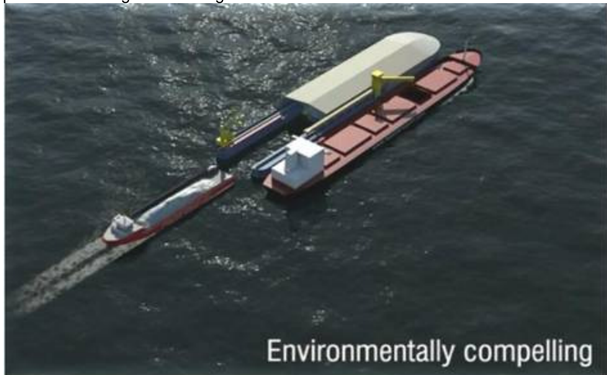
Image 1. Floating harbour concept

tonne and an operating surplus of around A$100 million a year at full production during the first stage.