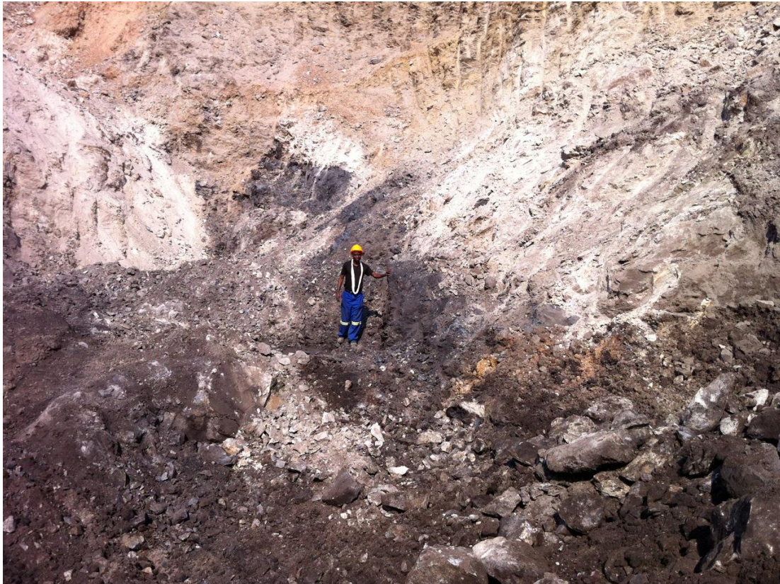
The Chowa Open Pit Mine with the highly visible manganese mineralisation

During the Quarter the Company finalised its technical, legal and financial due diligence on the acquisition of 100% of the share capital of African Asian Mining Development Ltd (“AAMD”).