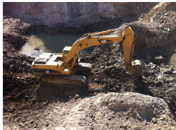
Mining commencing following the first production blast