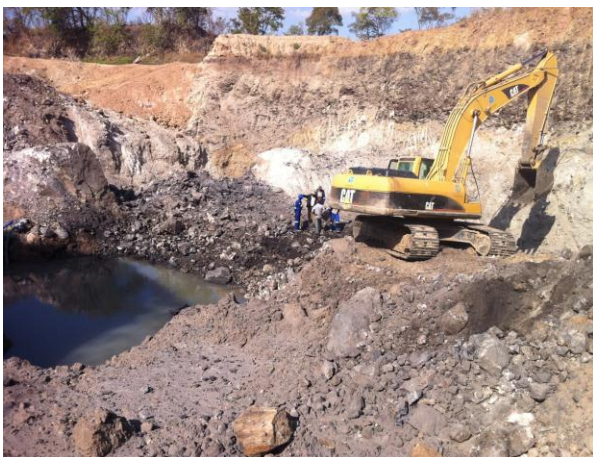
Inspection of the pit following blasting

The commencement of mining operations on the Chowa Mining Lease followed the dewatering of the existing open pit in June and the pre-stripping of material that continued throughout July 2011.