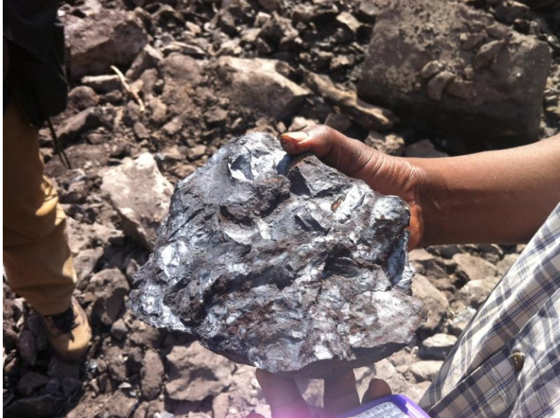
Manganese Ore from the Chowa Open Pit - dark coloured, highly brilliant, very low Iron characterizing the type of material on site.

The commencement of production, prior to the definition of a JORC compliant resource at the Emmanuel Project, whilst not the Company's preferred route to production, has been achievable given the exposed manganese veins in the former small scale open pit mine workings as well as the widths and strong continuity of mineralisation identified and exposed.