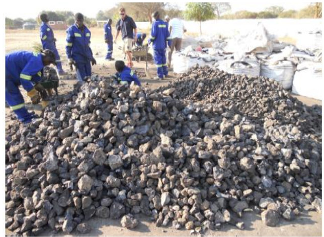
Manganese stockpile and storage facilities at Kabwe

Following completion of the Rights Issue the Company will construct a modular processing plant at the Emmanuel Project consisting of a primary and secondary crusher circuit, scrubber, triple deck screen, optical sorter circuit, spirals and tertiary crusher with the final concentrate bagged and packaged prior to export.