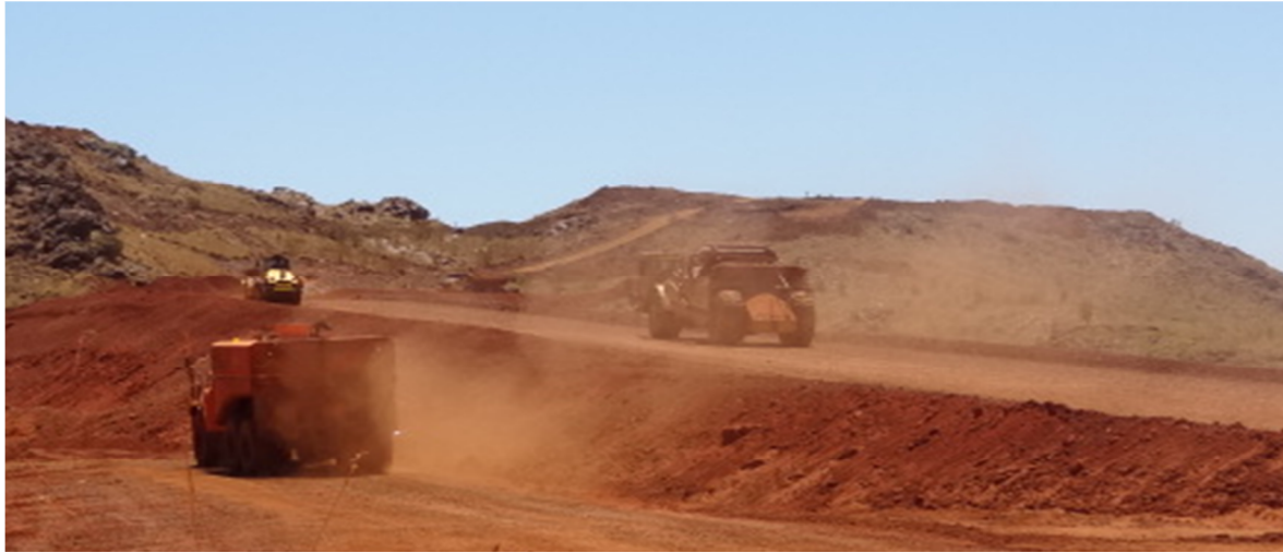
Mt Dove Mine Development