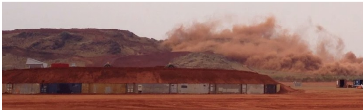
First Production Blast at the Mt Dove Mine