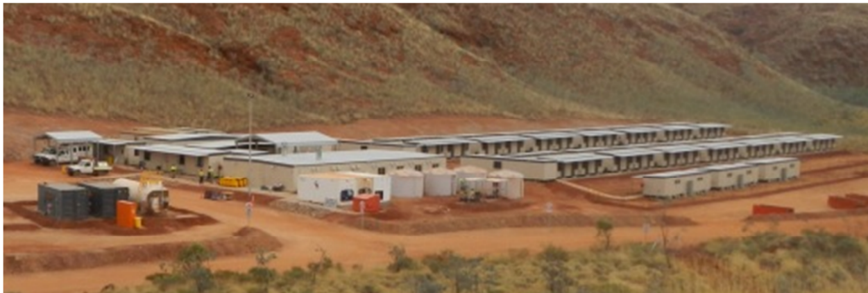
Abydos Construction Camp

The Abydos crushing services contract will see MACA develop and operate a crushing and screening plant for Atlas. Abydos is on target to produce the first run of mine ore by the end of the June 2013 quarter.