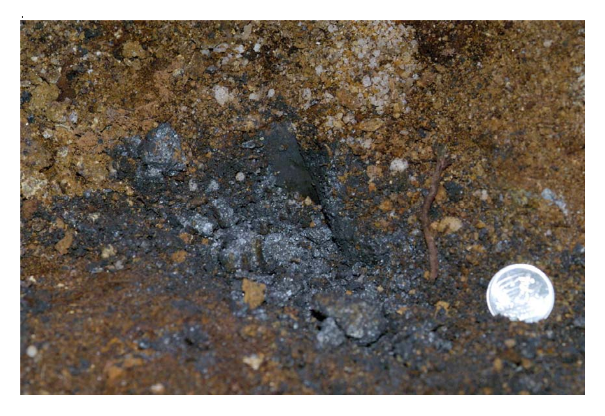
Black, oxidized sulphide/graphite mineralization encountered in trench area.