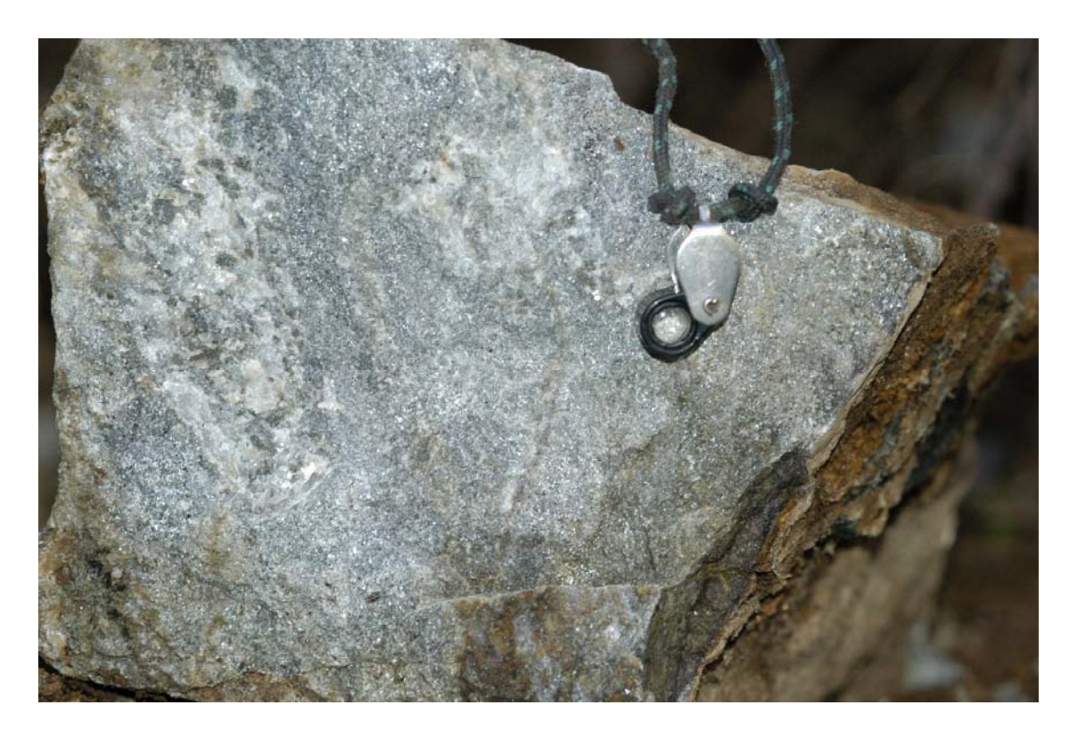
Bedrock exposed in hand-dug trench: quartzite, pelitic quartzite and slightly calcareous quartzite having disseminated pyrite and highly reflective, coarse-grained graphite. Exposed gossans in trenches in same area with 3m @ 8.98% Zn.