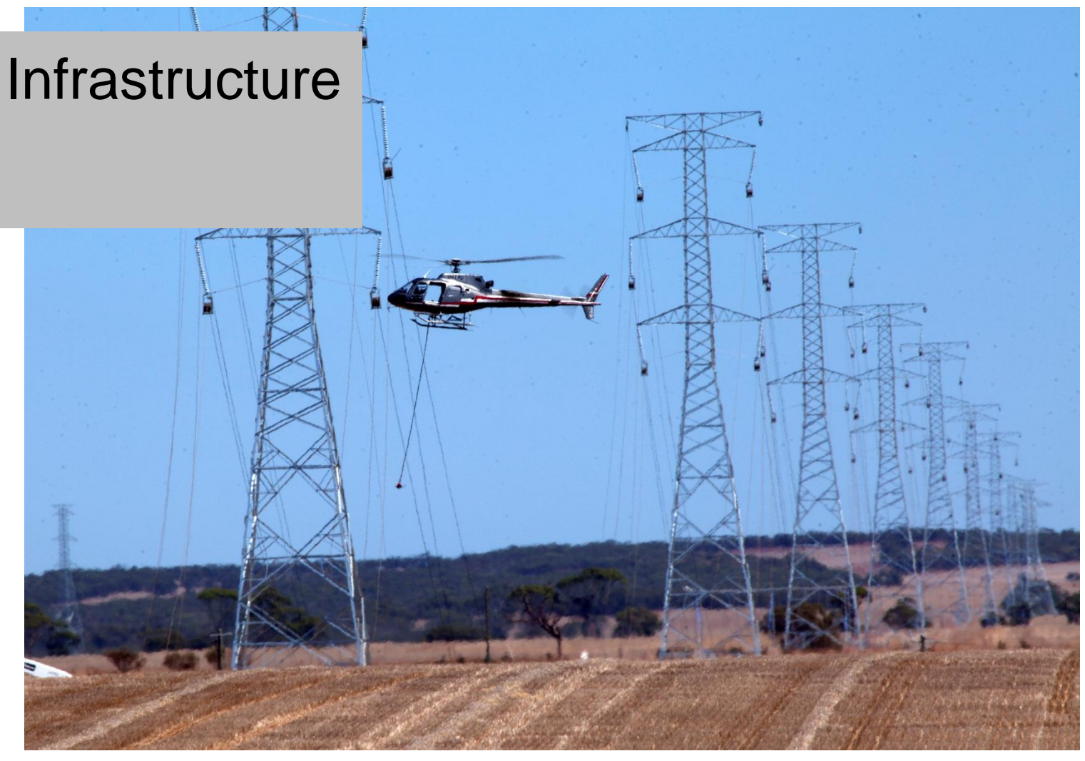
Aerial stringing of the 330kV power line is nearing completion.