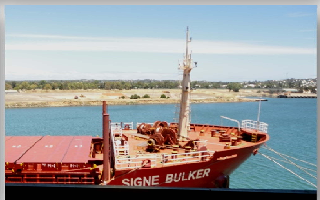
Loading the MV Signe Bulker at Bunbury port