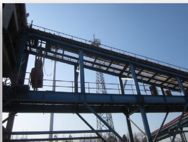
Conveyor to plant site