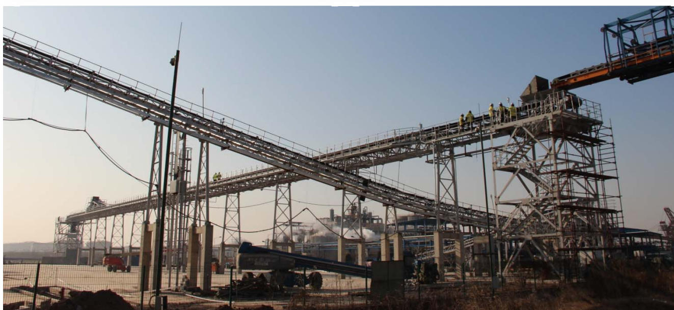
Conveyors at Area 10 – Spodumene stockpile area