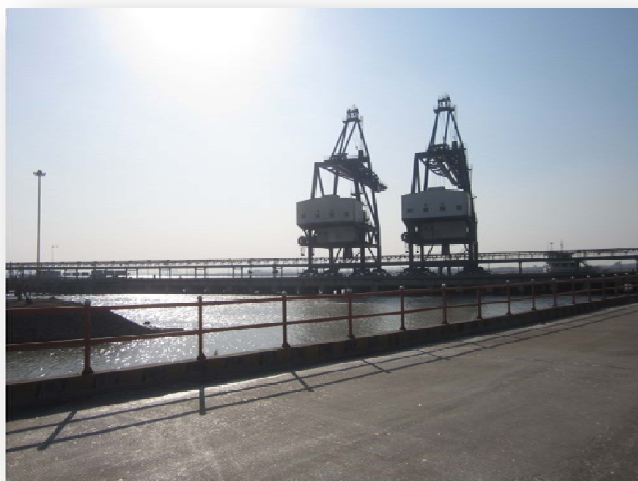
Two Lions wharf