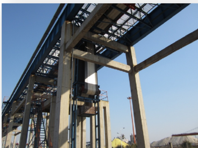
Transfer conveyor station