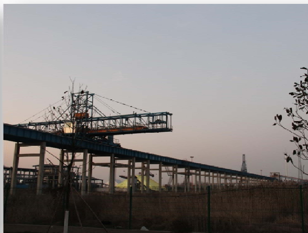
Over-land conveyor from wharf to plant site