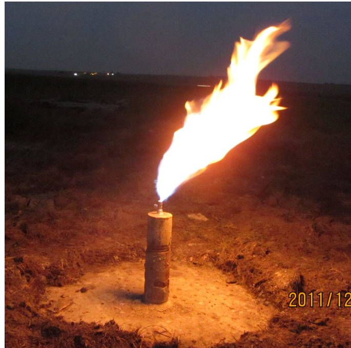
Figure 1: Flaring of spontaneous gas flow from KA-06 (since December 2011)

Kinetiko plans to commence an eight-hole exploration program on the Volksrust tenement (38ER) mid-2012. Once complete, Kinetiko will initially conduct two pilot wells on the Volksrust tenements in early 2013.