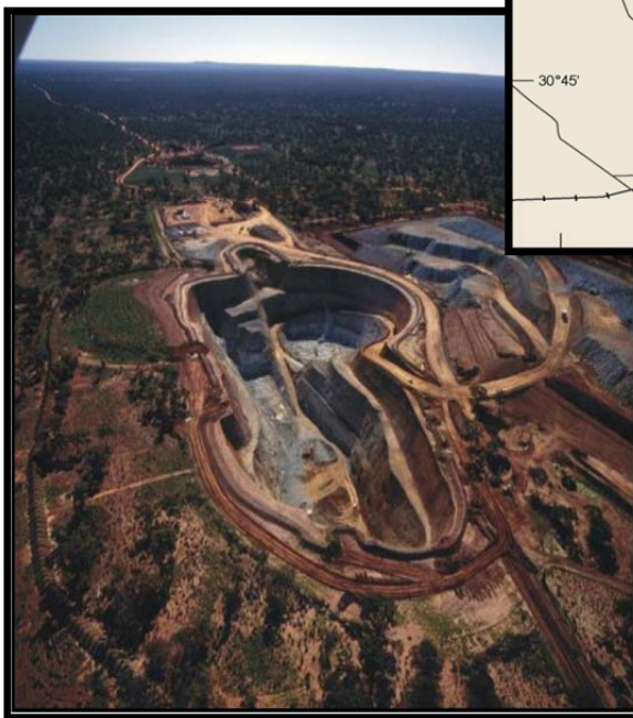
Bullant mine site aerial looking north