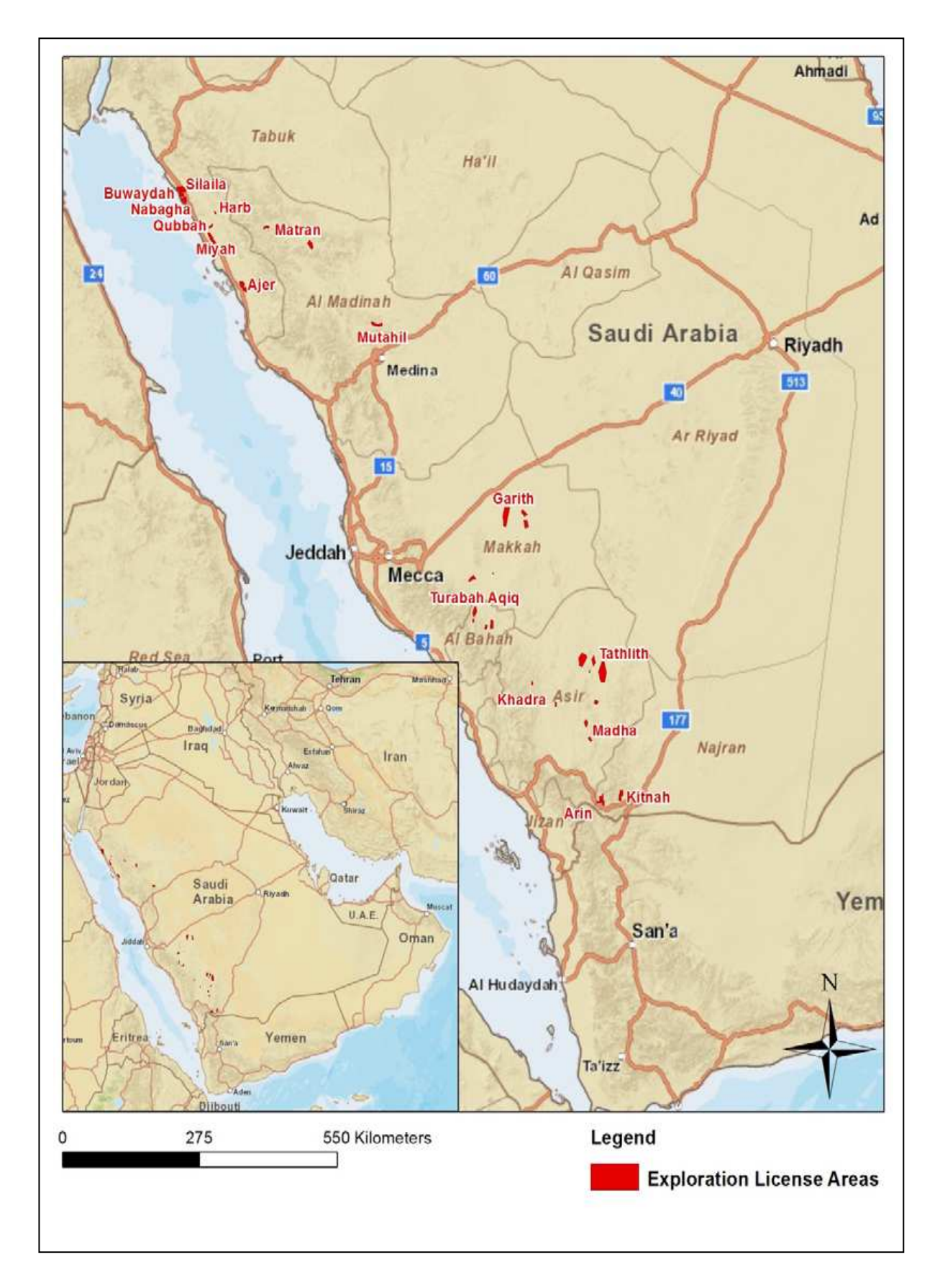
Figure 1: Location Plan - Exploration License Areas

Mawarid Energy and Mining Company (MEMC), Kingdom of Saudi Arabia