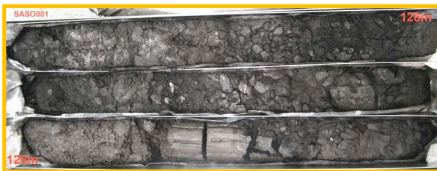
Figure 2: Example of high quality drill core sample of mineralised interval from the Saffron deposit.

~ The estimates of exploration target sizes mentioned above should not be misunderstood or misconstrued as estimates of Mineral Resources. The estimates of exploration target sizes are conceptual in nature and there has been insufficient results received from drilling completed to date to estimate a Mineral Resource compliant with the JORC Code (2004) guidelines. Furthermore, it is uncertain if further exploration will result in the determination of a Mineral Resource.