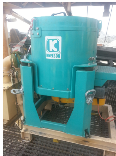
Figures 3 - New leaching tanks and Knelson Concentrator