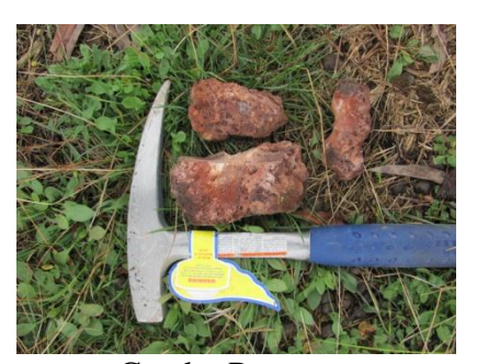
Crosby Prospect Gossanous volcanic