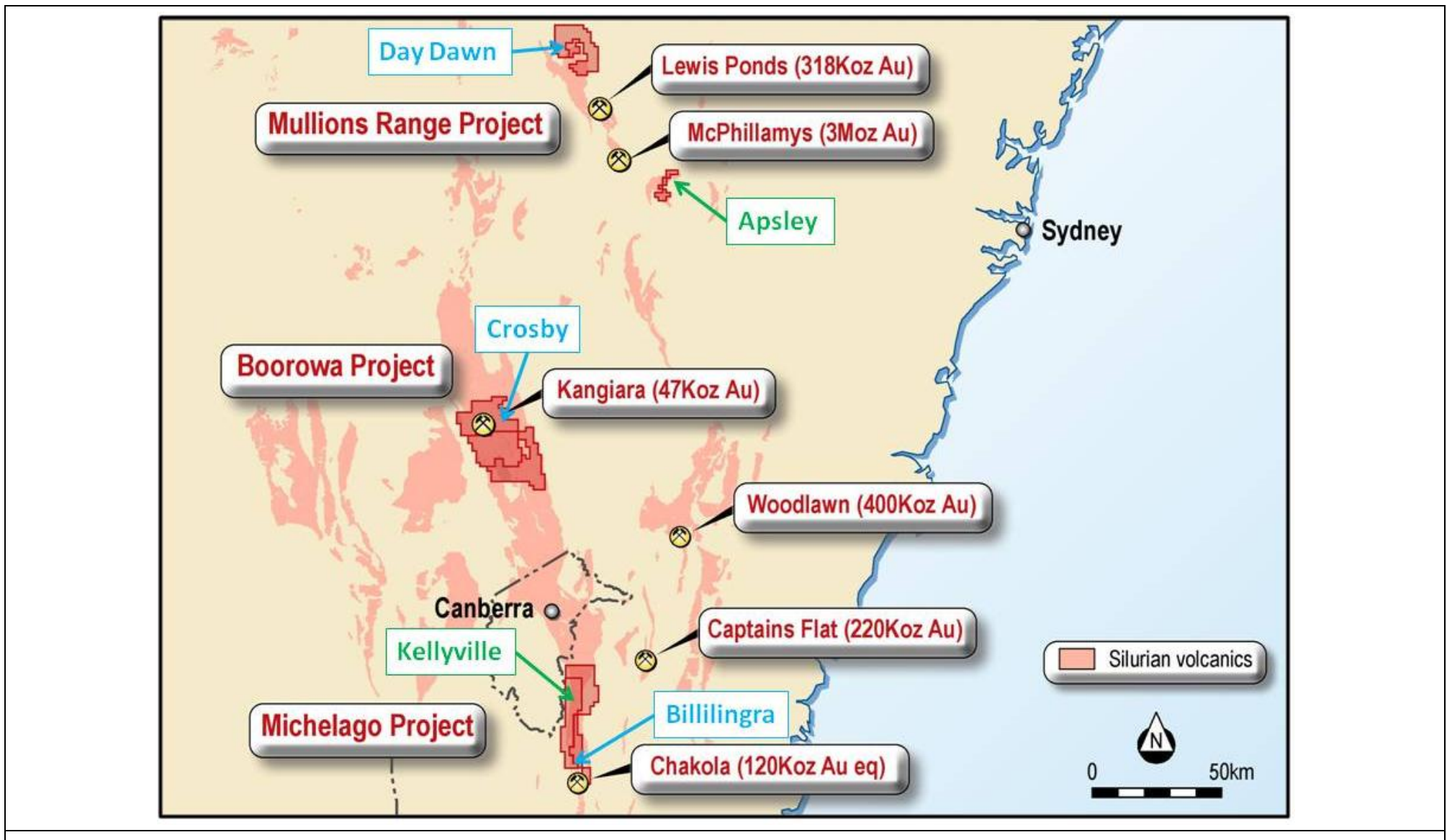
Figure 1: Oakland Resources-Mullions Range, Boorowa and Michelago Projects. New prospects shown in green