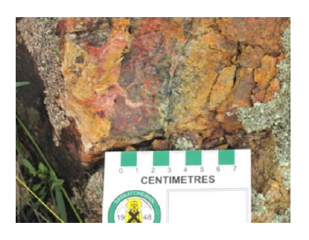
Crosby Prospect Quartz vein with alteration selvedge