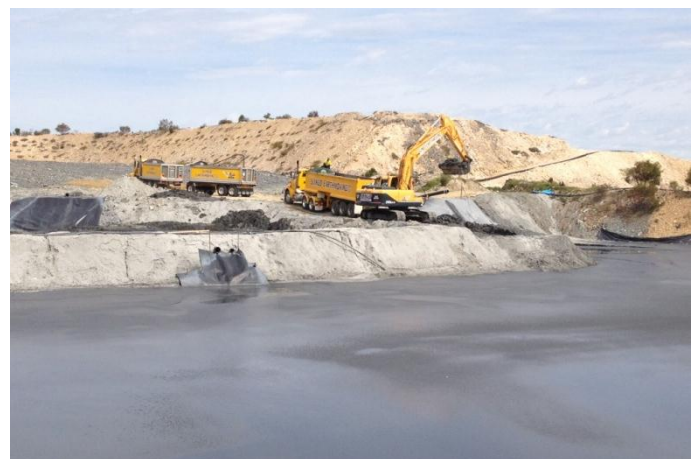
Tailings harvesting from drying pad