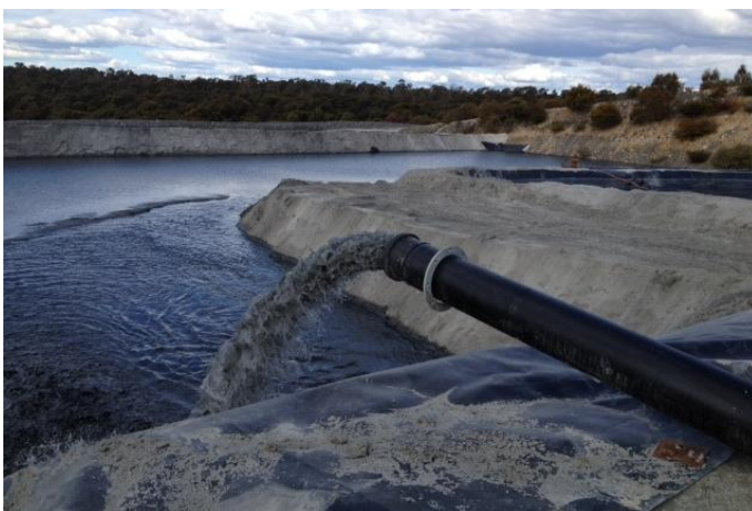
Tailings discharge onto drying pads