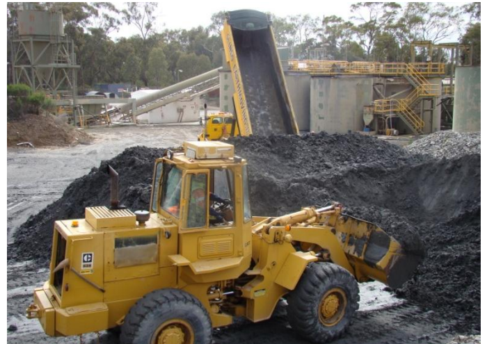
Tailings delivered to the Porcupine Flat Gold Processing Plat