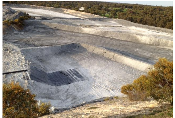
Prepared drying pads for Kangaroo Flat tailings