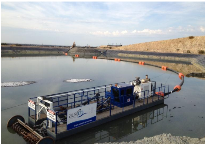
Dredge in Kangaroo Flat tailings dam