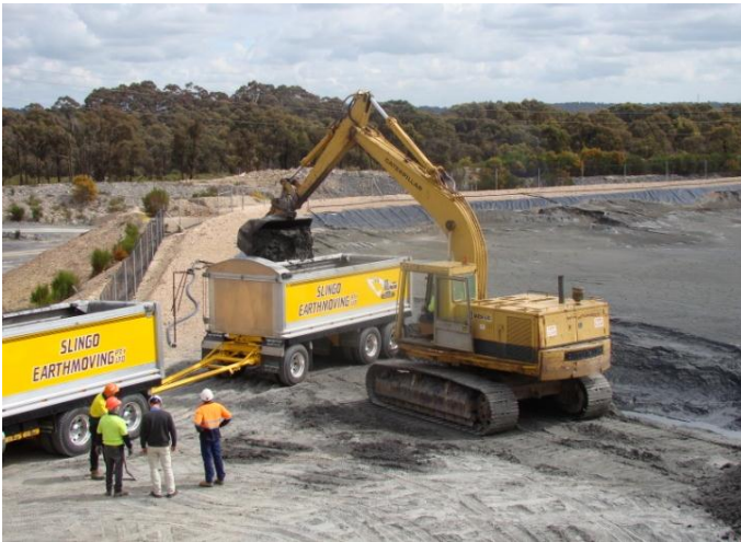
Excavator removing tailings from Kangaroo Flat tailings dam