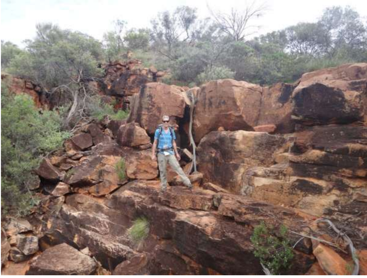
Figure 3. Geologist mapping an example of the thickly-bedded Mereenie Sandstone in the southwest corner of the Allambi Property.