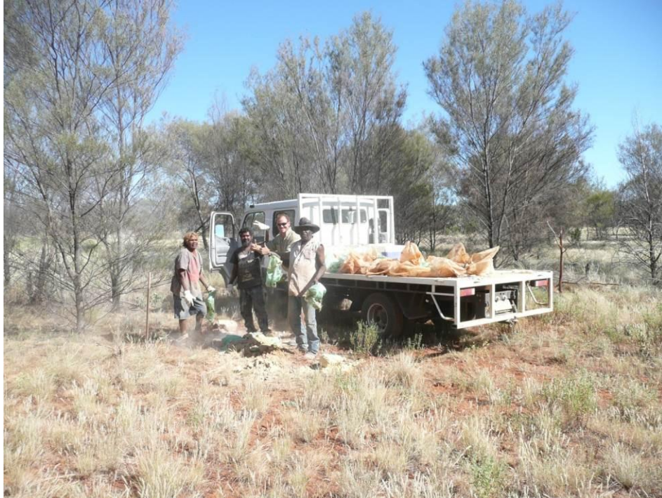
Figure 3. Work Crew cleaning up samples bags at a Barrow Creek 1 drill site.