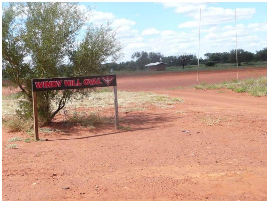
Figure 4. Windy Hill Oval - home of the Ampilatwatja Bombers football club.