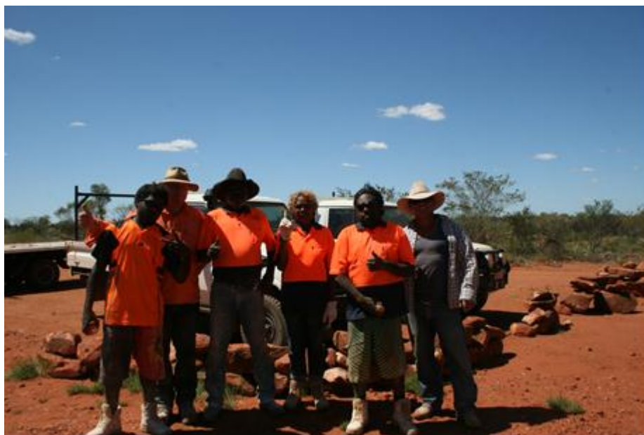
Figure 2. Work Crew from Ampilatwatja with Rum Jungle staff at Barrow Creek 1 camp.

Rum Jungle Resources Ltd has also sponsored the local Ampilatwatja Bombers football club in an upcoming football carnival at Ampilatwatja which attracts up to 20 indigenous teams and crowds of up to 3000 people. The company is proud to be a sponsor of the team which generates a great source of pride within the community.