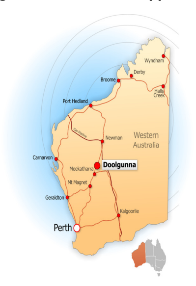
Figure 1 – DeGrussa Copper Mine location

Mobile: +61 419 929 046 (Nicholas Read) Mobile: +61 421 619 084 (Paul Armstrong)