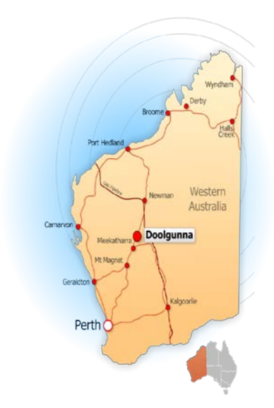
Figure 1 - DeGrussa Copper Mine location