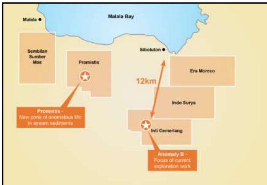
Figure 2 – Malala Molybdenum Project area

The Company previously entered into an agreement with China Guangzhou Group Corporation (CGGC). This agreement expired on 31 December 2011 and the Company has been discussing with CGGC the termination of the agreement and renegotiating a new agreement pending final regulatory approvals. The project is still awaiting forestry approval to proceed to production. The Company believes all approvals will be obtained and is working with the Indonesian parties in this regard. The Company is hopeful that this will be concluded by 30 June, 2012.