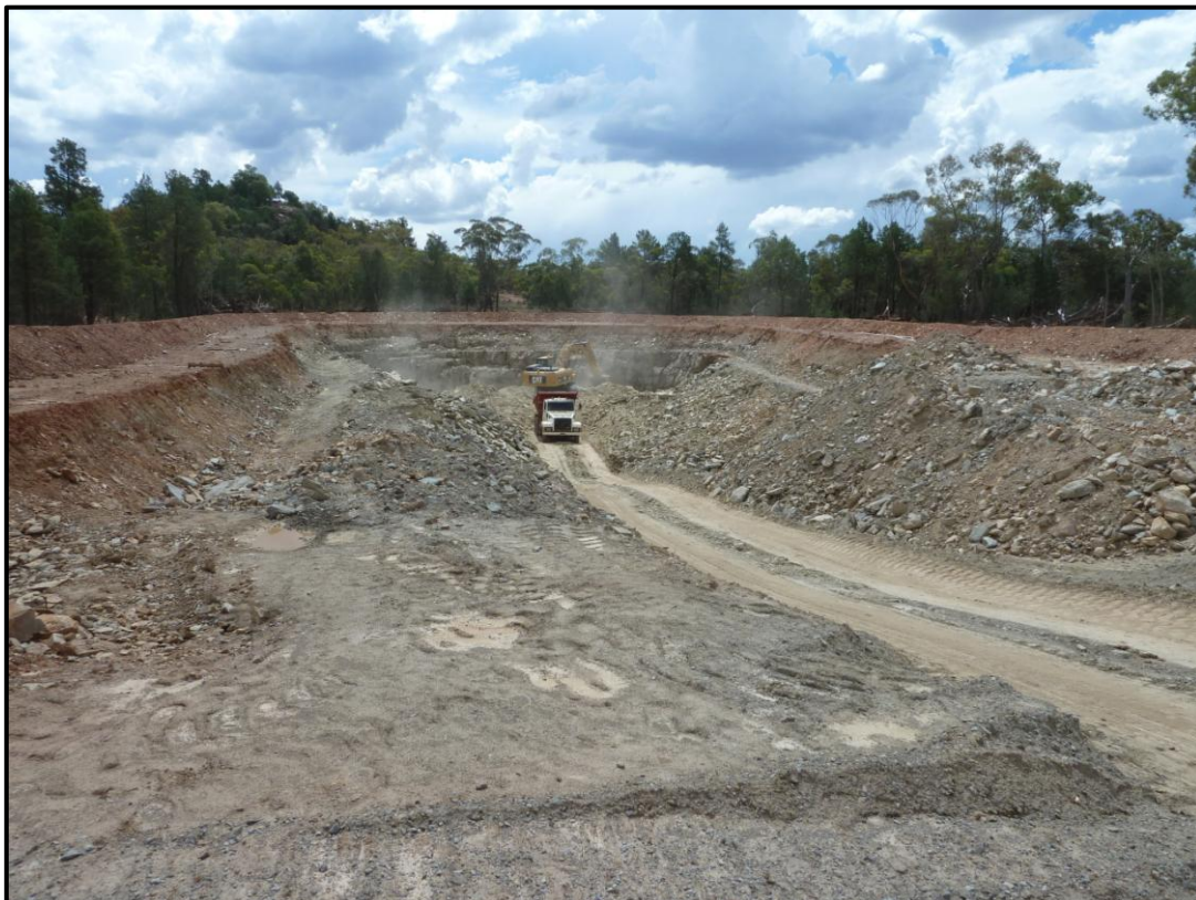
Progress on the boxcut – Hera Deposit

YTC considers that significant exploration upside exists not only in the extension of the existing lenses, but also for Hera to evolve into a major gold-base metal system consistent with the pedigree of Cobar-style deposits.