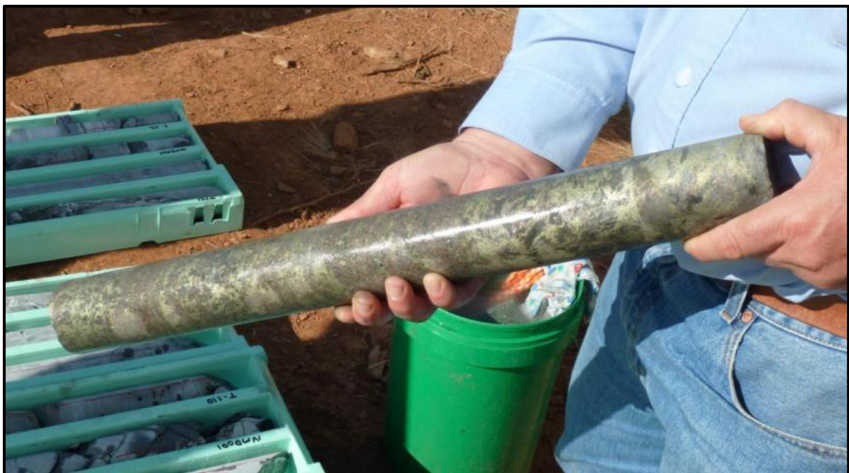
Massive sulphide mineralisation – Nymagee Copper Deposit

YTC considers the Nymagee deposit to represent the upper part of a larger 'Cobar style' copper dominant mineral system, analogous to the world-class CSA copper mine located approximately 90km north-west along strike. The company has budgeted a continuing aggressive exploration campaign at Nymagee for 2012.