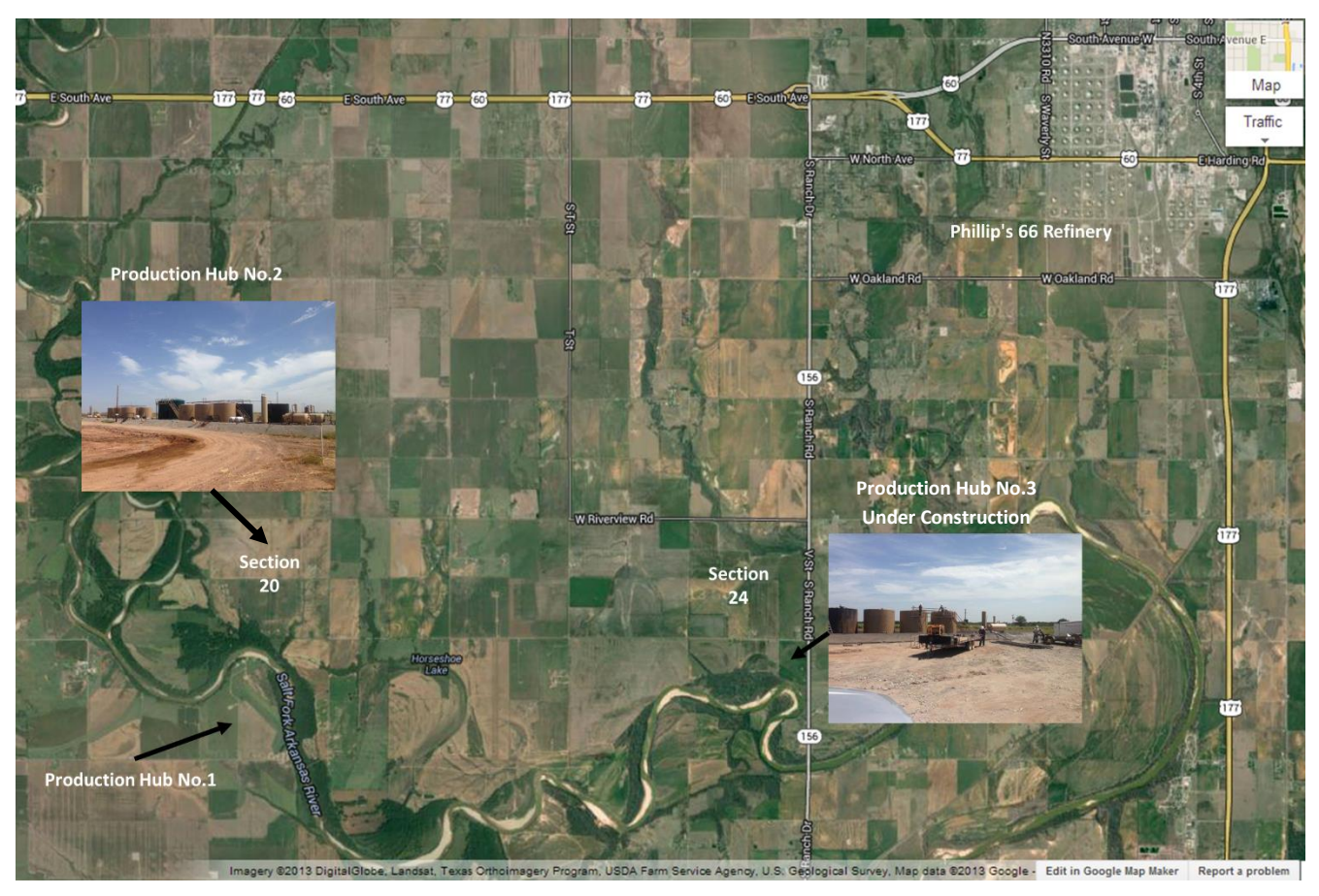
Figure 1 Location of AusTex Operations near Ponca City, Oklahoma