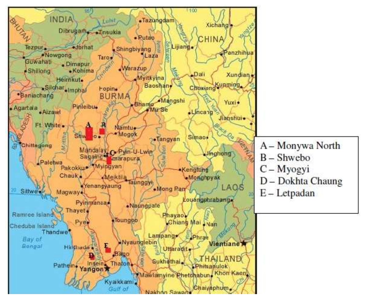
Figure 1 – Map of Myanmar Showing the Locations of Horizon mines applications

In addition to copper/gold mineralisation, Myanmar is prospective for other economically important metals. There are distinct ultramafic zones (prospective for Cr, Ni, Cu, Mg and Pt), as well as acid intrusive and extrusive style mineralisation in Precambrian age rocks (prospective for Pb, Zn, Ag, Mo, Cu and Au). More recent periods of granitic volcanism in the east of the country has resulted in tin, tungsten and antinomy mineralisation.