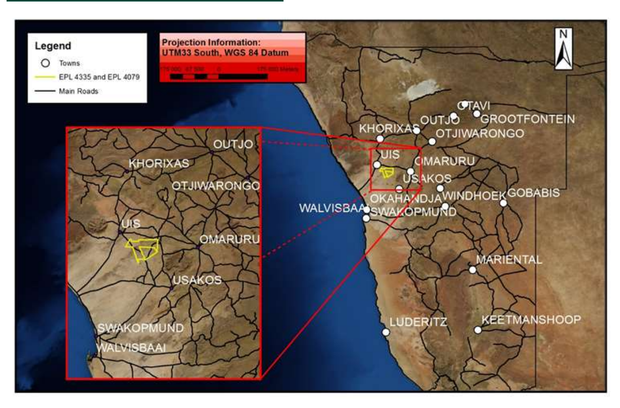
Figure 2: Location Map of the Area 51 Graphite Project in Namibia

Fax: (03) 9077 9233 Email: generaladmin@baru.com.au Website: www.baru.com.au