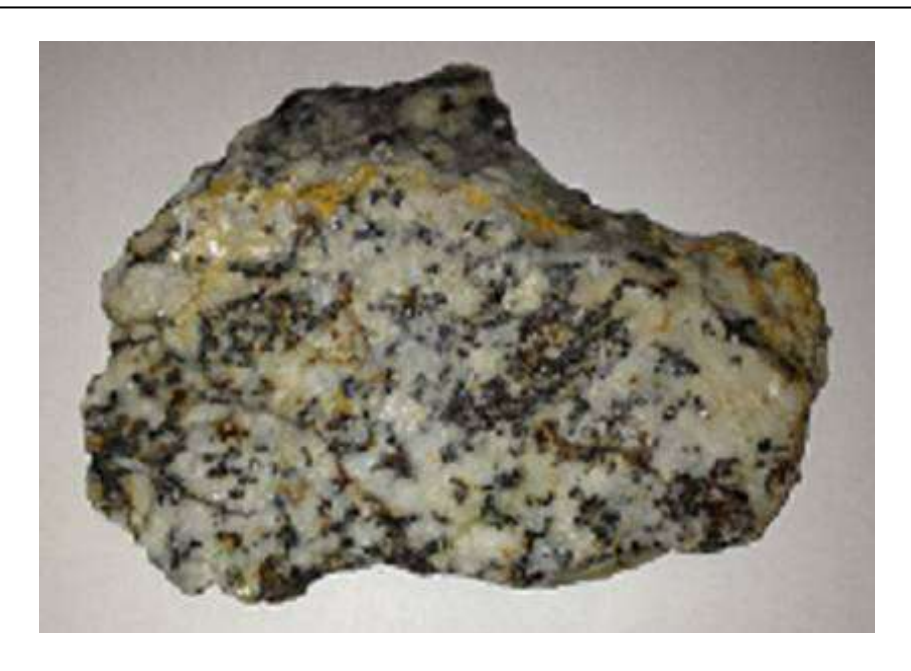
Figure 1: Graphite Sample taken from site

The Directors of Baru Resources Limited ('Baru', 'BAC' or 'the Company') provide the following update on the progress of the Area 51 Graphite Project exploration activities: