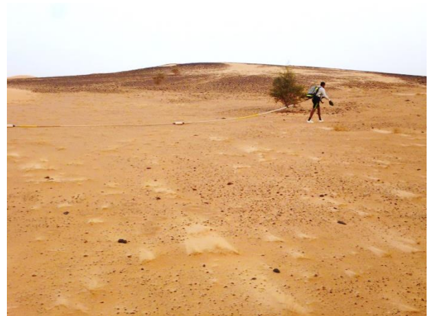
GPR Field Operator dragging antenna across BIF mound

The GPR results are currently being processed along with acquired satellite data. Following these results, the next phase drilling program will be finalised.