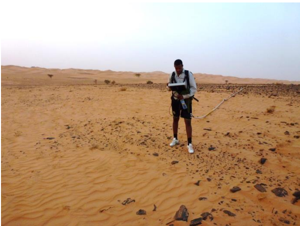
GPR Field Operator standing on BIF float.

A ground penetrating radar (GPR) survey has been conducted by Charter Pacific's exploration contractors, SEMS Exploration. The purpose of the survey is to provide further targeting information ahead of a proposed drilling program which will test the depth continuity and banded iron formation (BIF) thickness. Traverses for the GPR survey were chosen over areas of existing ground magnetics, rock chip sampling and trenching. Pictures below show the GPR survey in action over known BIF occurrences.