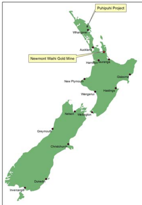
Figure 1: Location of project area

The permits are for an initial five year period with additional extensions permissible following completion of the proposed exploration programmes.