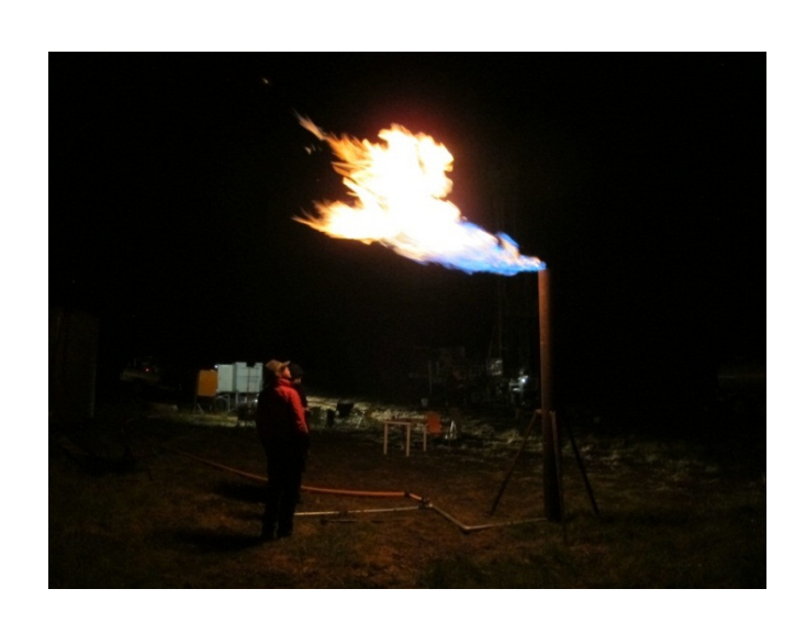
Initial flaring on exploration well KA-03PT, before testing