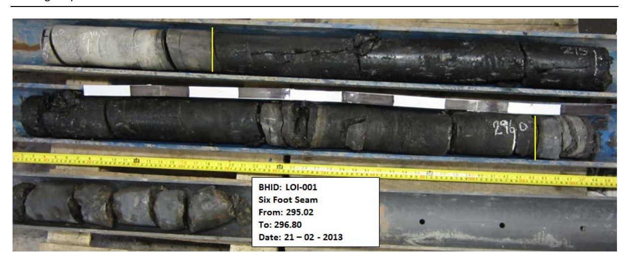
Figure 3 LOI-001 - Six Foot Coal Seam Core<sup>1</sup>