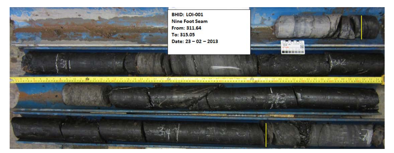
Figure 4 LOI 001 - Nine Foot Coal Seam Core 1