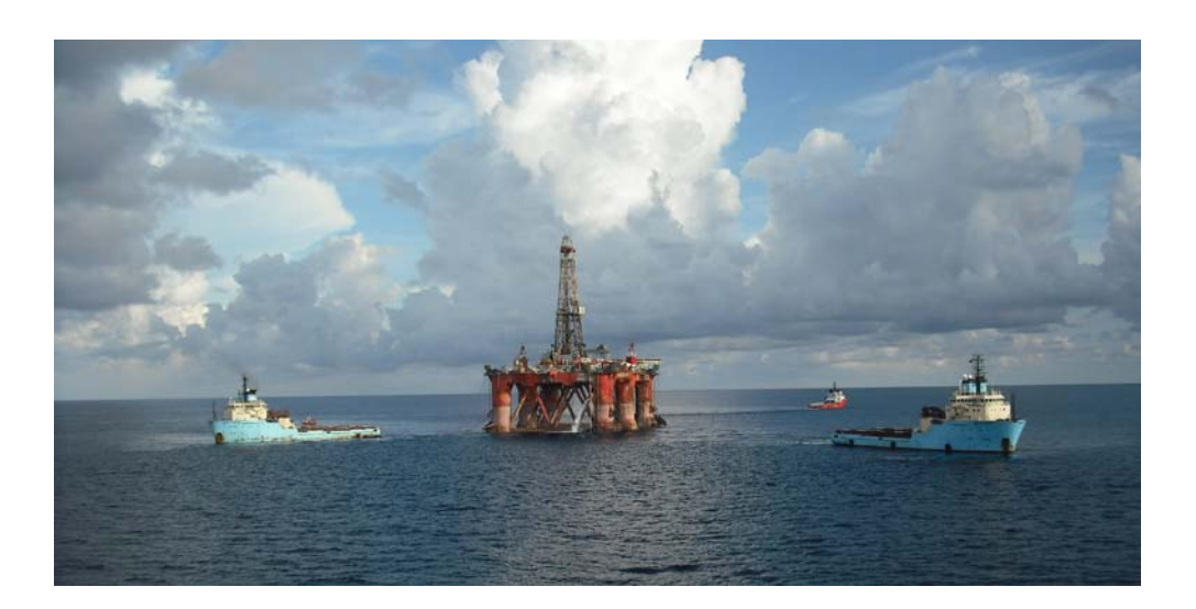
Figure 1: MODU Ocean Patriot being moored on field, taken from FPSO Rubicon Intrepid