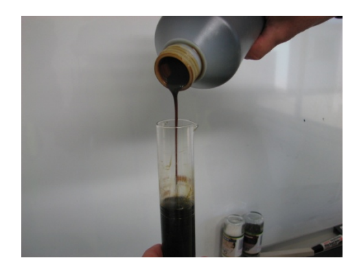
Figure 3. Kockatea Shale oil sample

Note: The hydraulic fracture stimulation fluids used for intervals 2-4 were recycled on subsequent zones in order to significantly reduce the amount of water used throughout the program. This technique of recycling water was successful, and will be implemented in any future hydraulic fracture stimulation programs that Norwest undertakes.