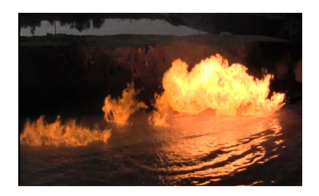
Figure 4. Kockatea Shale flare 02/09/2012

Irwin River Coal Measures (3000 – 3050m): This interval is a ~350 metres thick hybrid shale/sandstone interval, and has only had a very brief period of flowback during the original program due to the previously mentioned operational constraints. It is believed that having left this interval for some time now, the pressure will have recharged the formation and opened up the fracture network, so that a good flow of gas is expected. The hybrid nature of this interval is quite appealing, as the sandstone layers represent much higher porosity than the shale layers, and so potentially the ability to contain a larger quantity of gas in the pore space. This interval will be flowed back later in the program, once the work on the Carynginia Formation is complete.