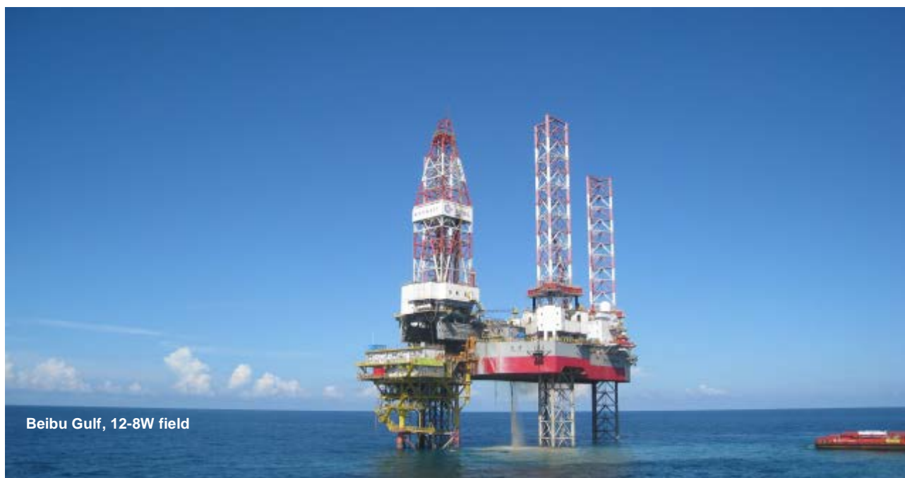
Beibu Gulf, 12-8W field

BMG remains in a non-production phase (NPP). ROC continues to pursue a farm-down or divestment process for BMG. ROC interest in the field has increased from 37.5% to 50% as Pertamina and Sojitz have each issued a notice of withdrawal, subject to government approval.