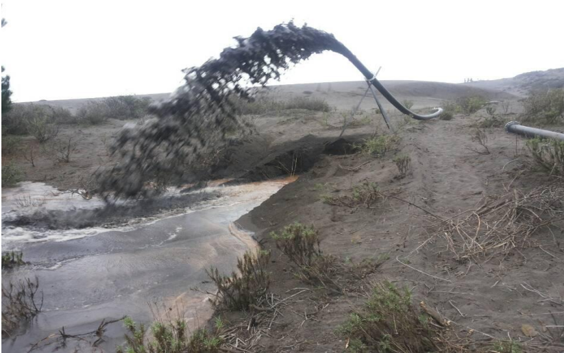
Tailings being pumped out into tailing pond for recycling of water