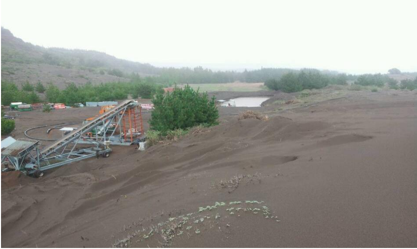
Operation Site Overview