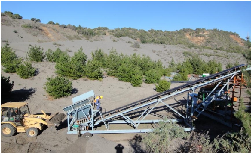
Loading sand onto conveyor belt