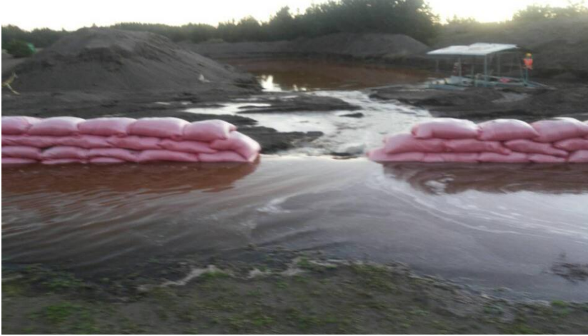
Recycle Water into contained pool