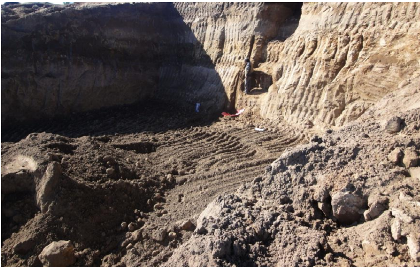
Excavation of Old Dunes