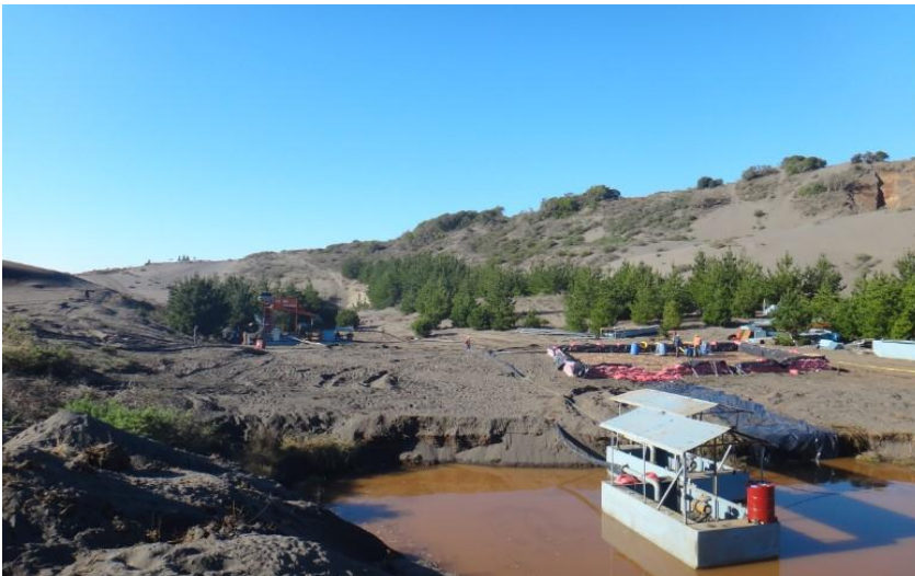
Water supply and recycling system