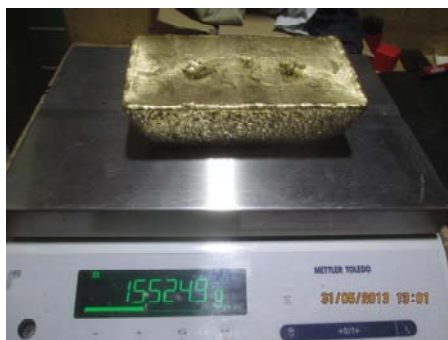
15.5 kg Gold Bar