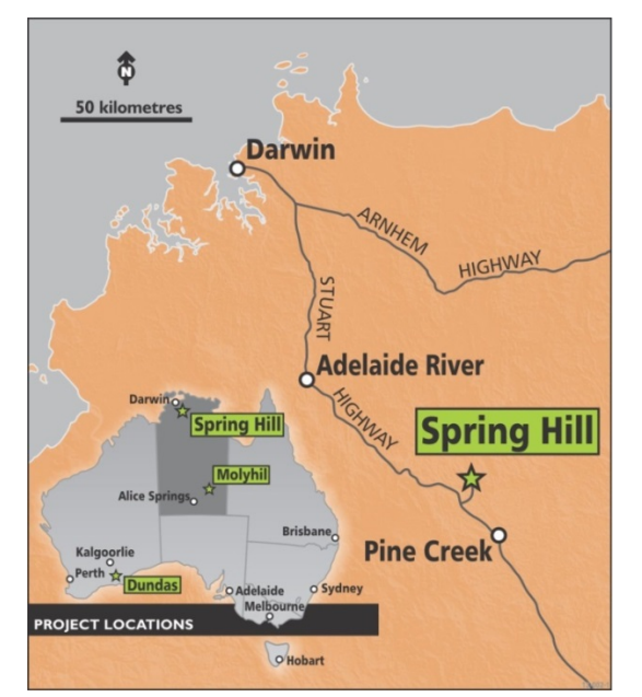
Figure 1: Spring Hill project location