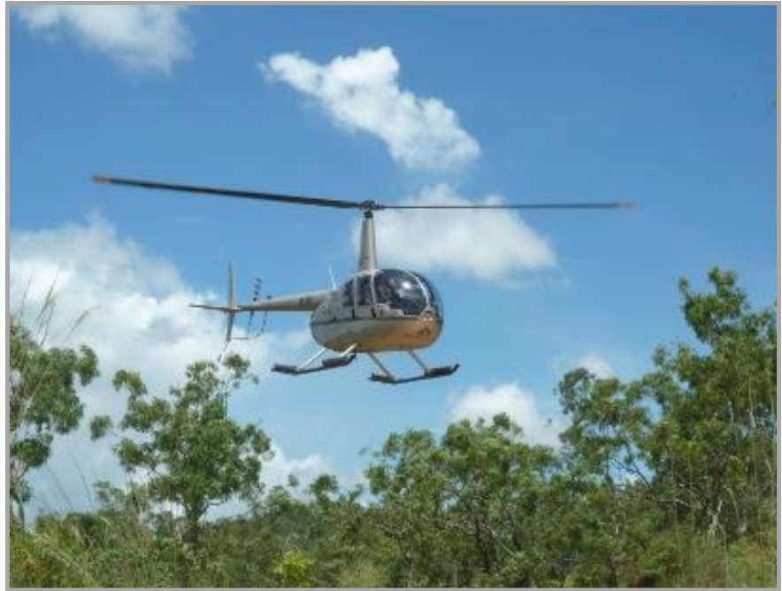
Photo 1: Helicopter supported reconnaissance exploration of EL29458, 6 March 2013.