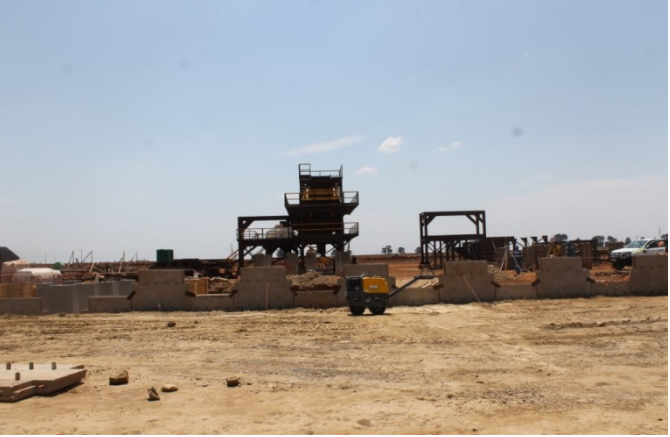
BC1/BC2 secodary crushing and screening Construction of the plant wing-wall underway module constructed on site