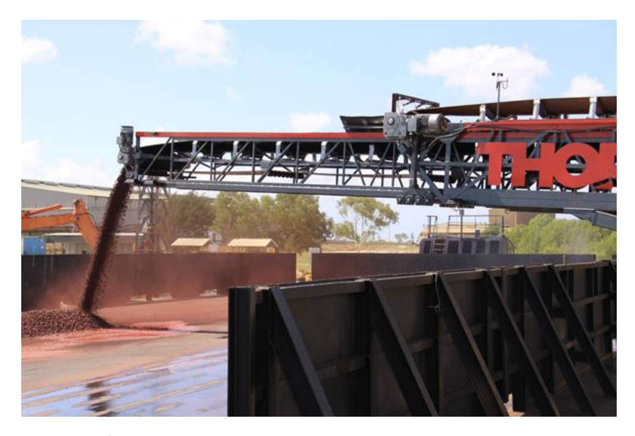
Fig 5: Loading of Barge