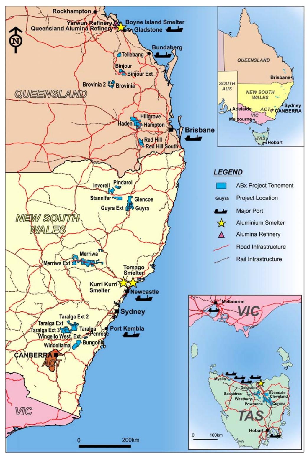
Figure 5: ABx Project Tenements and Major Infrastructure