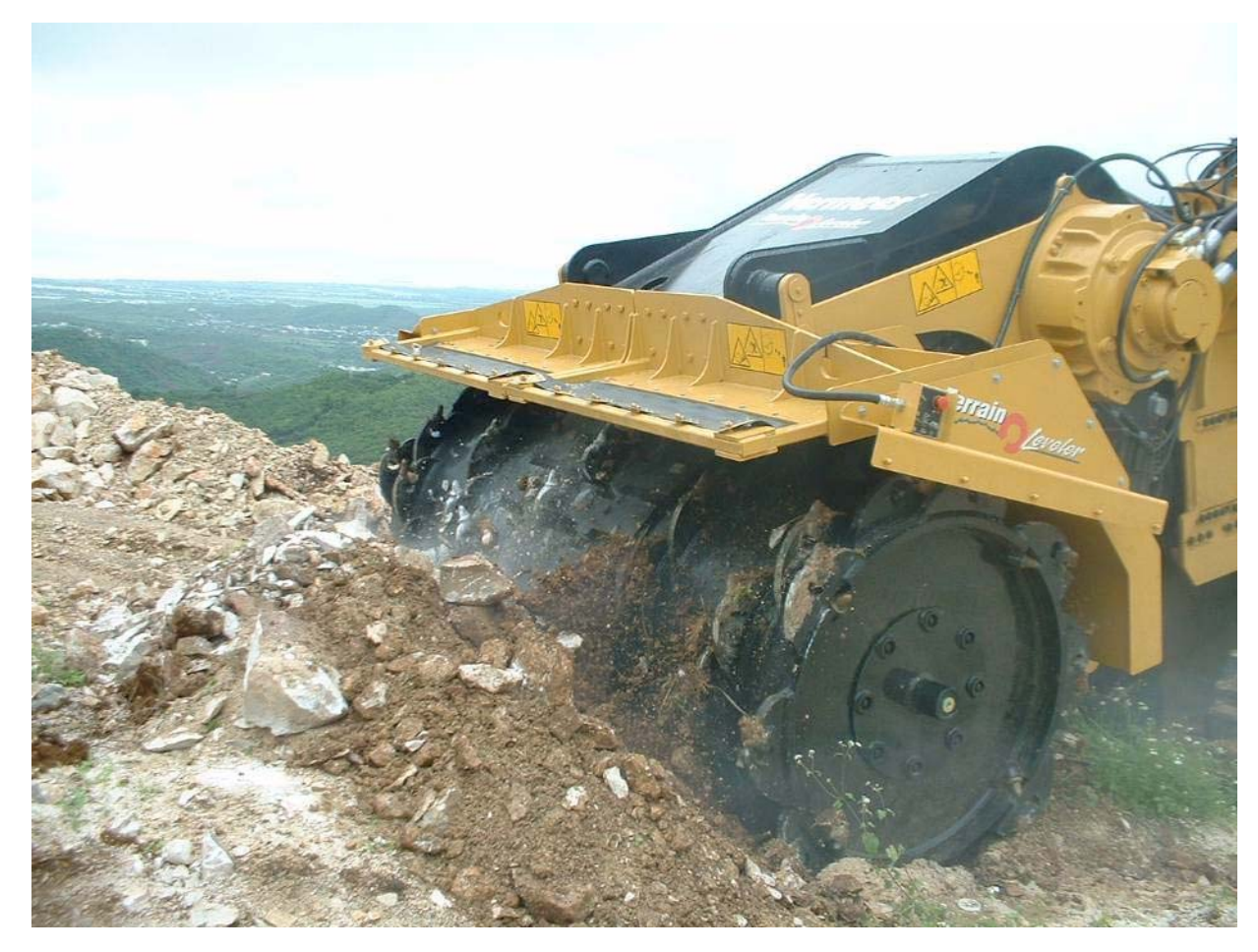
Figure 3: Vermeer Surface Miner: Close-Up of Cutter Wheels