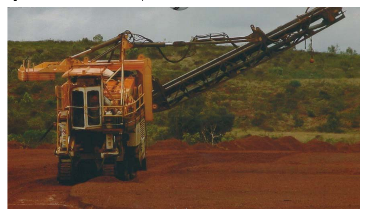
Figure 4: Wirtgen Surface Miner