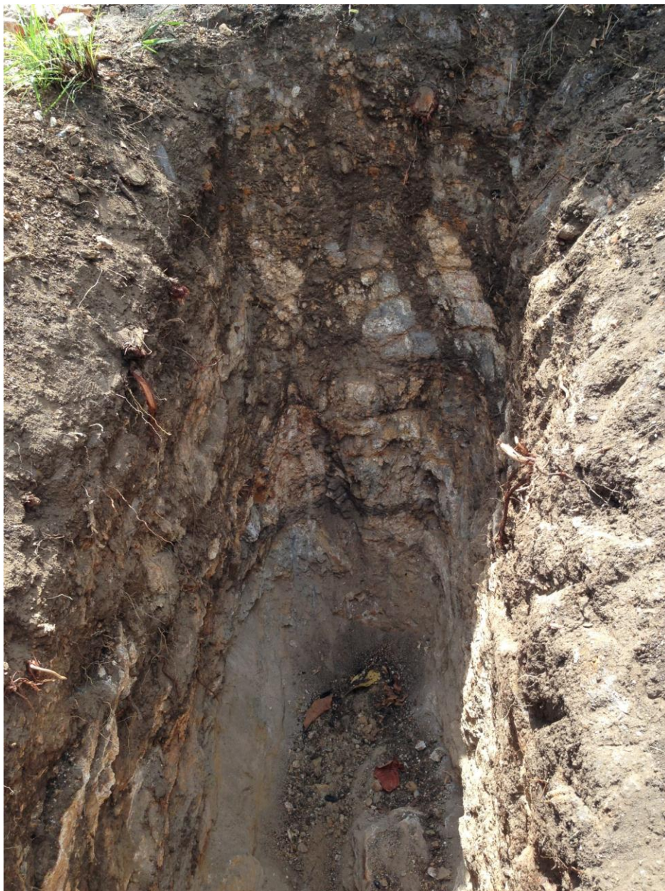
Figure 3: Graphite layers in exploration pit

More details will be provided following this visit.