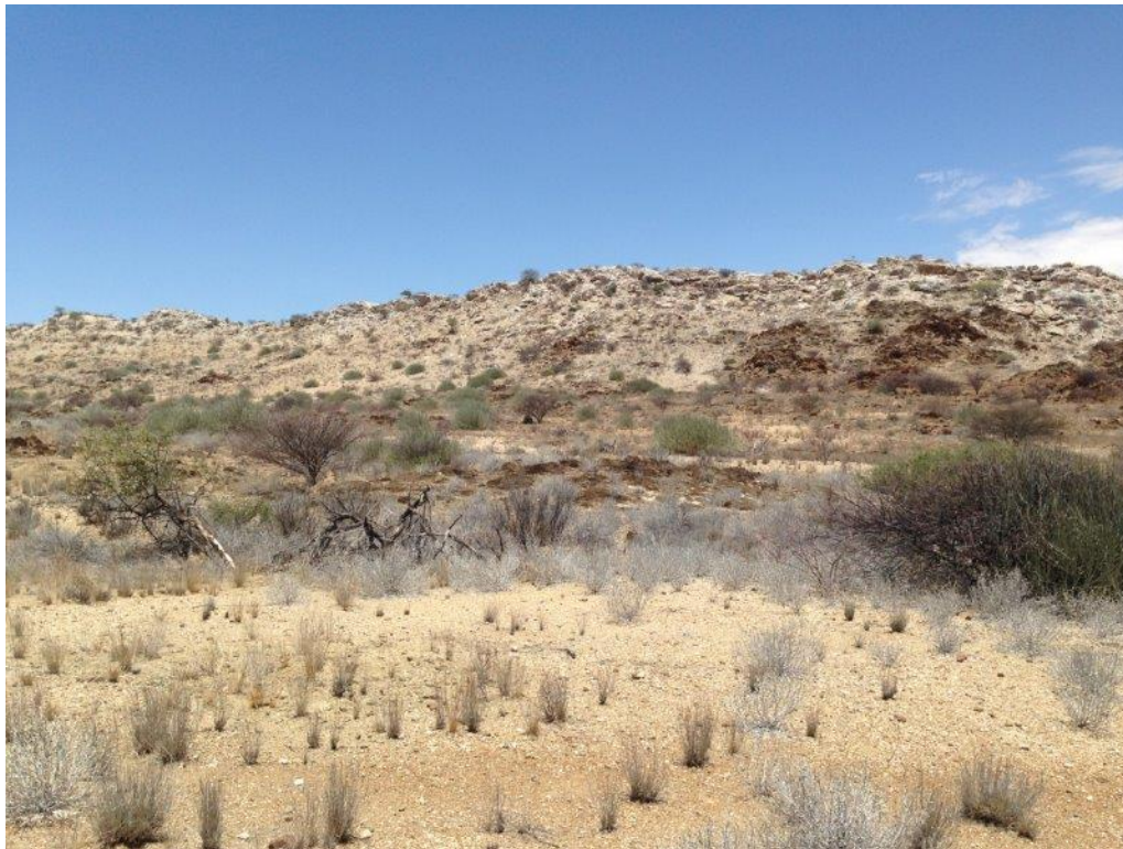
Figure 6: Outcropping formation at Area 51 Graphite Project

Figure 6 represents the typical outcropping formation which occurs extensively over the project area and hosts the Graphite in marble.