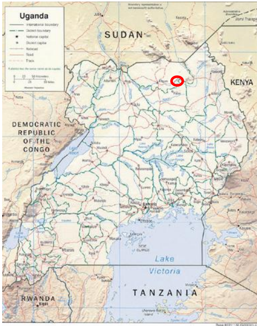
Figure 2: Location map of Kitgum Graphite Project, Uganda

Below is a map showing the location of the project near the town of Kitgum, Uganda: