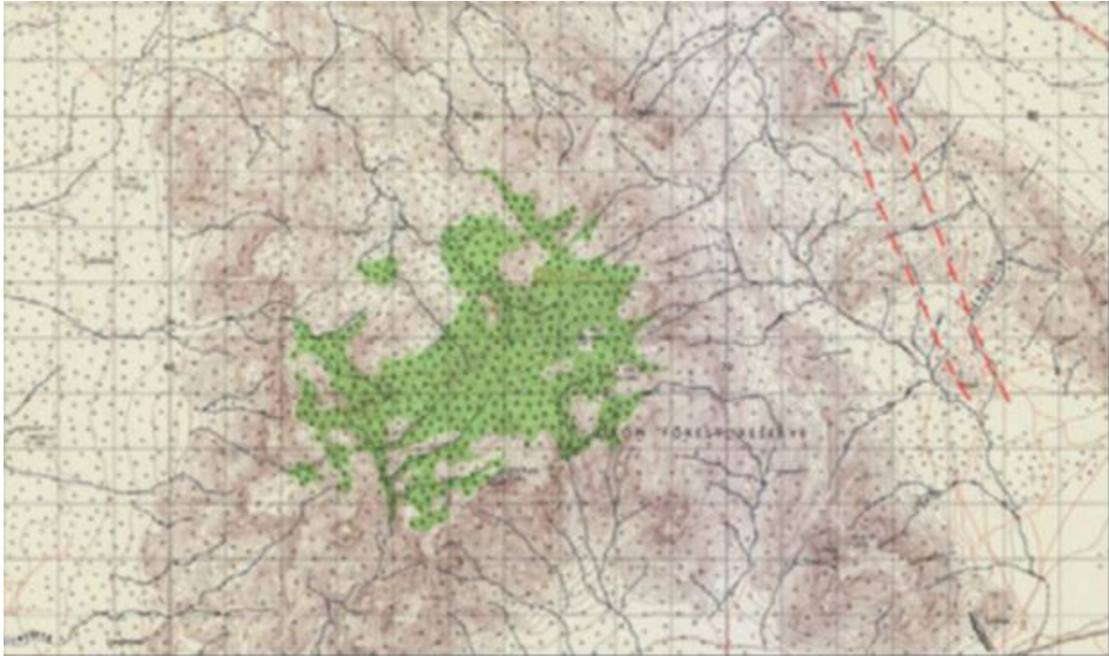
Figure 4: Topographical map showing project strike (in red) over the mountain area