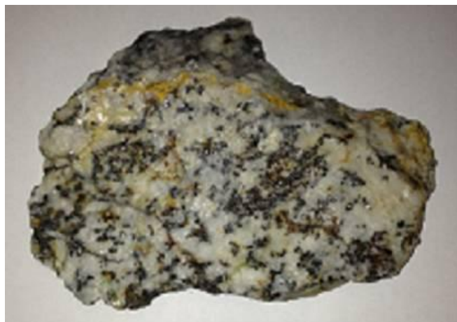
Figure 1: Graphite Sample taken from Area 51 site