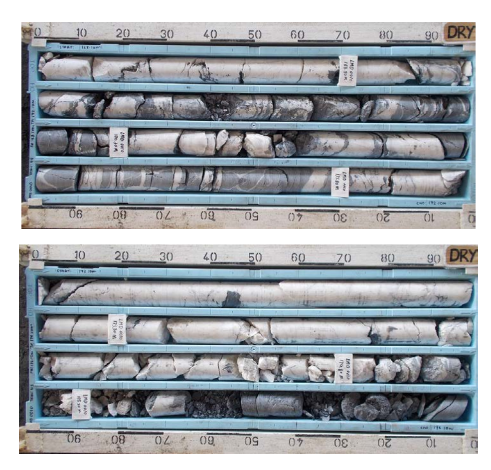
Photographs; HQ Drillcore from MSZ intersection in LMD010 showing extensive quartz veining and shearing.

The Company was successful in defining a gold-in-tailings resource at Lubuk Mandi Gold Mine of 1.5M tonnes at 0.7 g/t Au for 34,800 contained ounces of gold (see ASX announcement 26 November 2013). Planning is now advanced for the exploitation of this resource with final designs and identification of equipment suppliers now at an advanced stage, and on track to commence gold production during the current year.