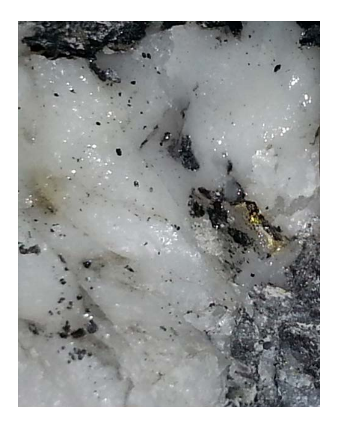
Photograph; Fine native gold particles in vein quartz from MSZ in LBD010. Field of view approximately 1 centimeter.