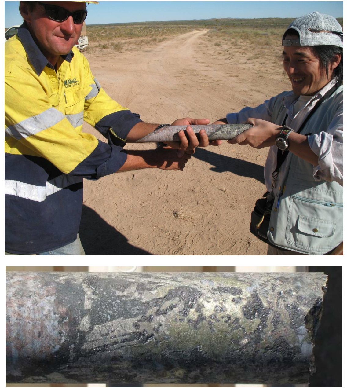
Photographs; Top-Drillcore from hole BNG001, part of abroad intersection which returned an average grade of 0.1% Cu over 200 metres down hole (see GBM ASX release dated 2<sup>nd</sup> September 2011). Bottom- close up of copper mineralization (chalcopyrite associated with magnetite in granite host rock) from this hole. This target will be further drill tested during 2014. [This information was prepared and first disclosed under the JORC Code 2004. It has not been updated since to comply with the JORC Code 2012 on the basis that the information has not materially changed since it was last reported.]

The exploration programme for 2014 and 2015 was planned at a recent meeting attended by representatives of all companies at GBM's Regional Exploration Office in Castlemaine, Victoria. Key areas for testing in the current field season are targets in the Bungalien and Mount Margaret West Project areas, with up to 5 targets prioritised for drill testing in each of 2014 and 2015 field seasons, with geophysical and geochemical surveys also planned for a significant number of targets.