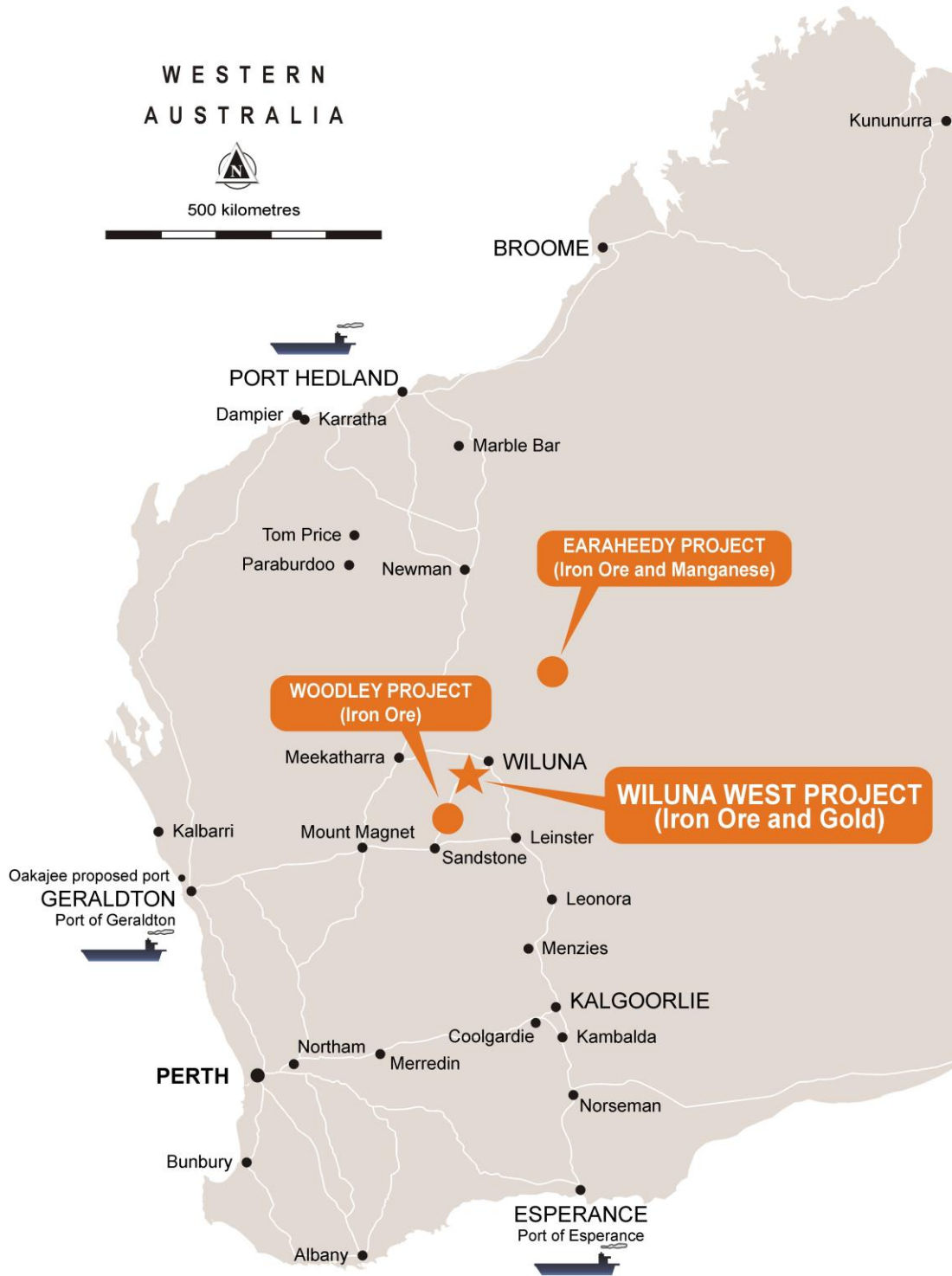
Figure 1: GWR Project Location Map