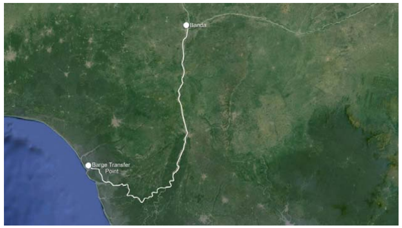
River Barge Route – Banda to Escravos

Each barge configuration will have dimensions of 21m by 286m long and are designed to carry loads of 4,800t to 8,000t, depending on river water levels. A configuration will be propelled by shallow draft four engine push boats with a preferred speed of 10 knots. Iron ore concentrate will be transported ~ 602km from Banda along the Niger River to the Escravos Transfer Station, a journey time of ~33 hours.