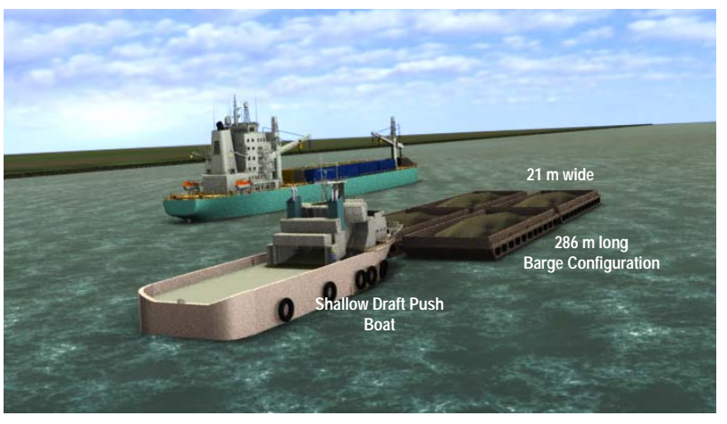
River Barging Configuration

Each barge configuration will have dimensions of 21m by 286m long and are designed to carry loads of 4,800t to 8,000t, depending on river water levels. A configuration will be propelled by shallow draft four engine push boats with a preferred speed of 10 knots. Iron ore concentrate will be transported ~ 602km from Banda along the Niger River to the Escravos Transfer Station, a journey time of ~33 hours.