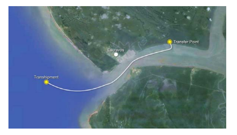
Ocean Barge Route – Escravos to Transhipment Facility