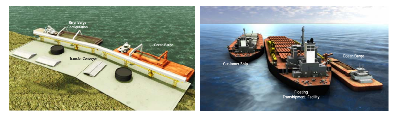
Proposed Escravos Transfer Station

The 20,000t self-propelled and self-unloading ocean going barge will be capable of transferring the concentrate to a floating transhipment storage facility in the Gulf of Guinea approximately 33km offshore. The floating transhipment facility will have a storage capacity of 200,000t and allow for the loading of Panamax and Cape size OGV's for global export markets.